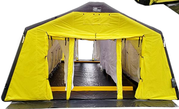
Shown above: Door End Panel view, part # 7924