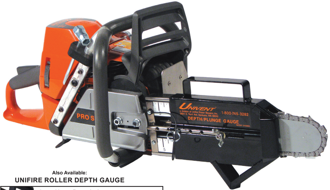
Also Available: UNIFIRE ROLLER DEPTH GAUGE